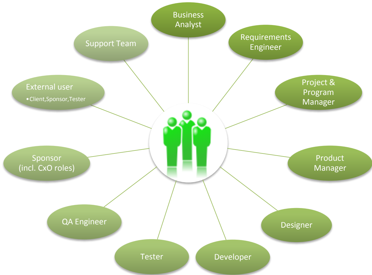
TeamCompanion user roles